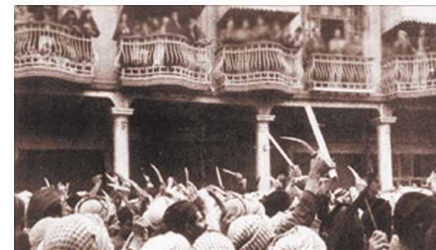
The Arab mob approached with knives, axes and other weapons.