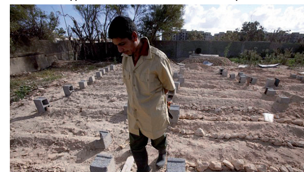
A Libyan visits the fresh graves of fellow countrymen who were killed by Qaddafi’s forces during the recent revolution.